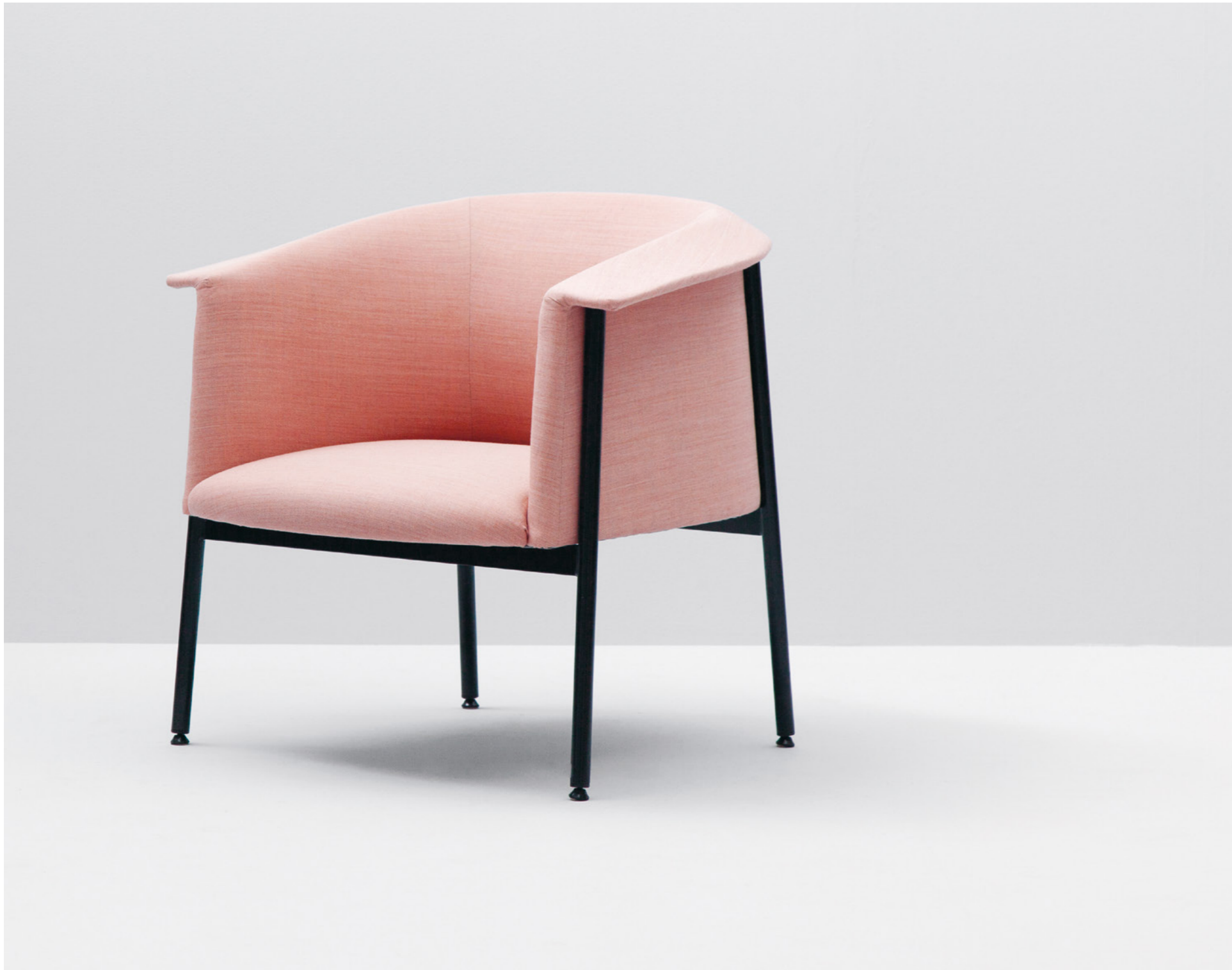
Kavai by Hallgeir Homstvedt