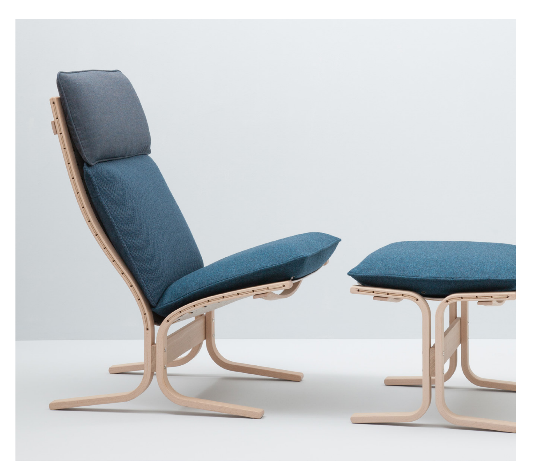
Siesta Trio by Ingmar Relling