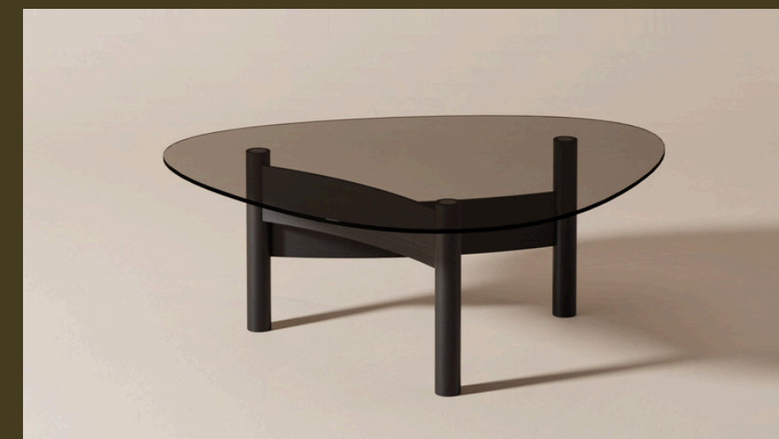
Smoked glass top - black stained oak legs