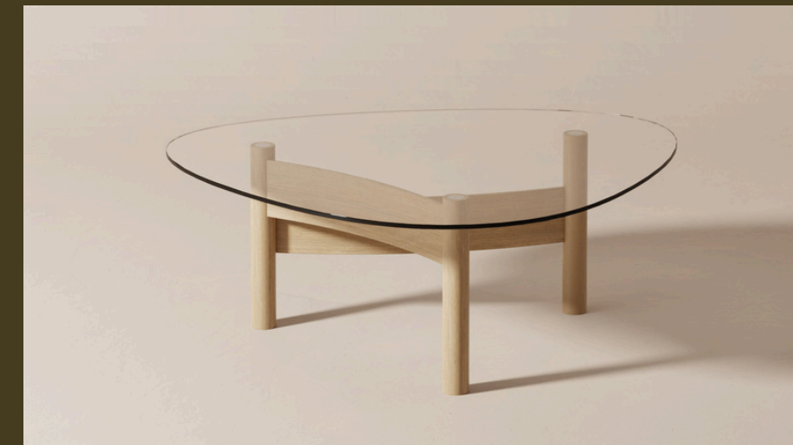
Clear glass top - lacquered oak legs