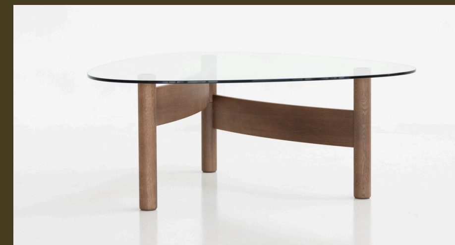
Clear glass top - smoked stained oak legs